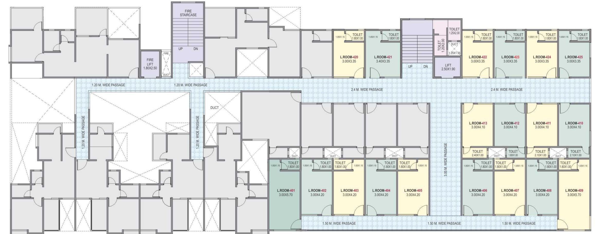
Area Statement in sq.m.