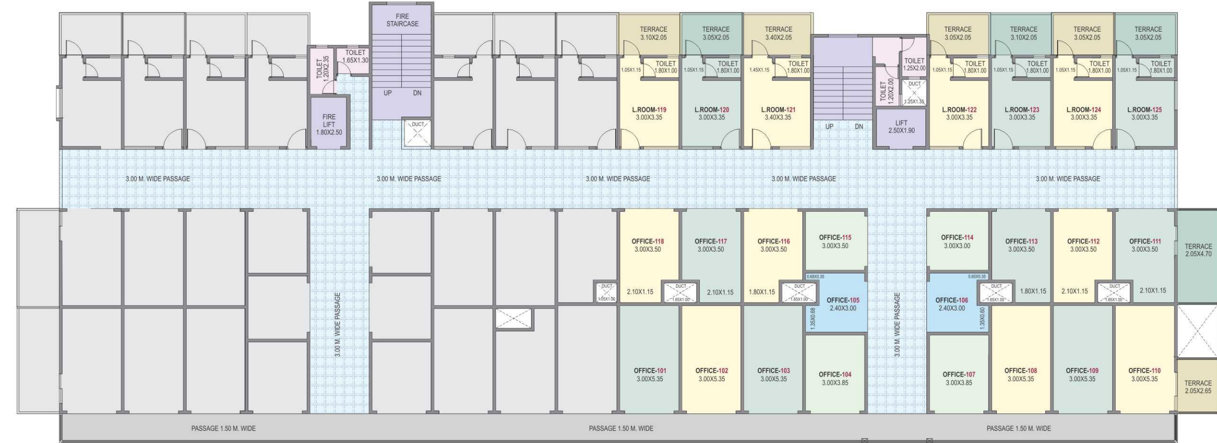
Area Statement in sq.m.