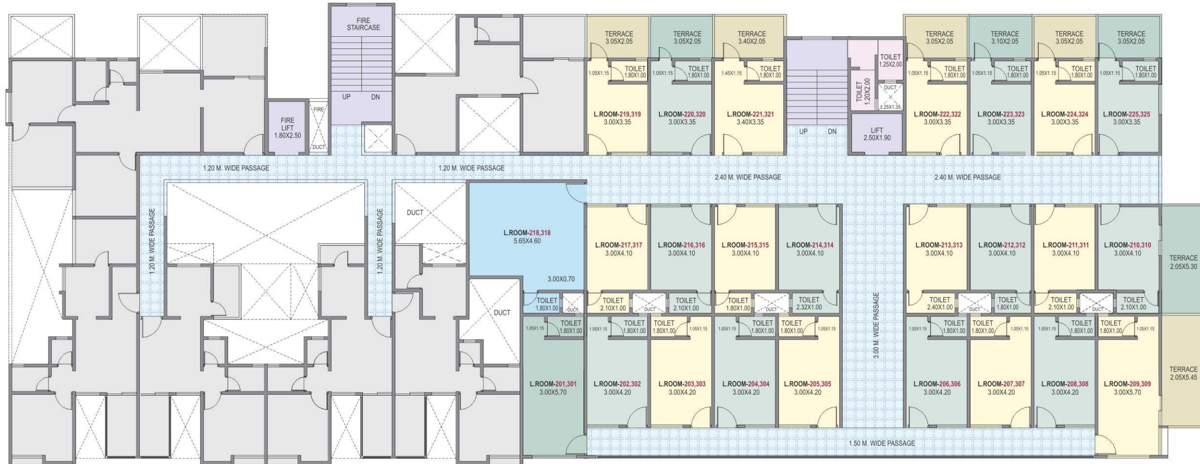
Area Statement in sq.m.